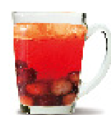
Red Dates Wolfberry and Long Yan Tea 桂圓杞子 紅棗茶 $15