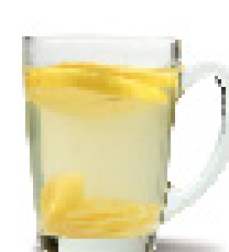
Deep-fried Prawn Toast 蜂蜜檸檬 薏米水 $12