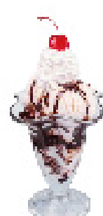
Homemade Sundae 自家雪糕新地 $18