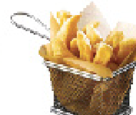
Black Truffle French Fries 黑松露薯條 $28