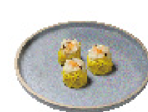
Pork Meat Dumplings with Crab Roe 蟹籽燒賣皇(3件) $36