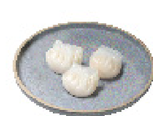
Shrimp Dumplings with Bamboo Shoot 竹筍鮮蝦餃(3件) $36