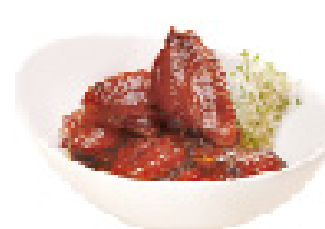
Loyal Chicken Wings Simmered in Homemade Sweet Soya Sauce (3pcs) 來佬汁雞翼 (3隻) $42